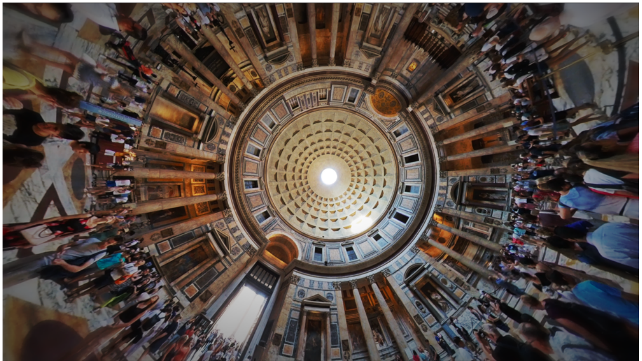
360° shot of The Pantheon in Rome