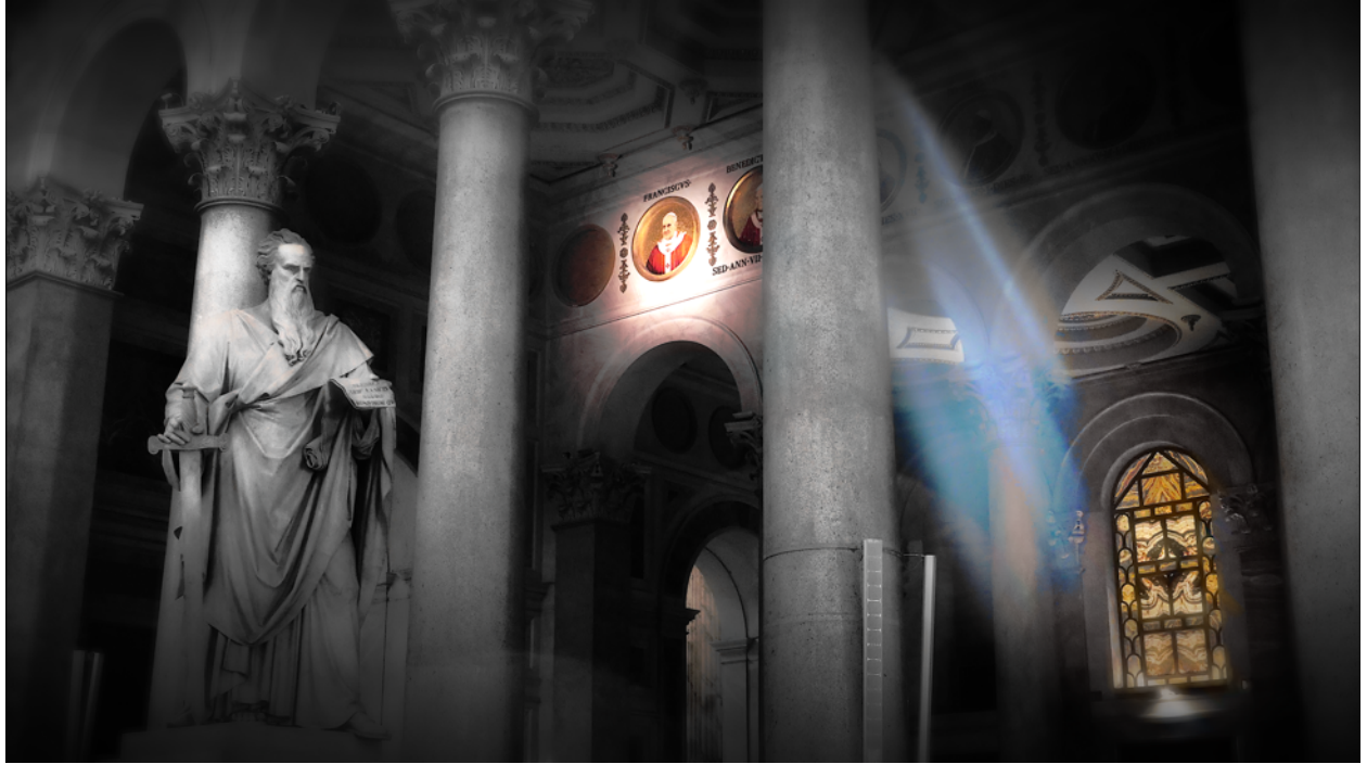
Basilica of St. Paul Outside the Walls in Rome