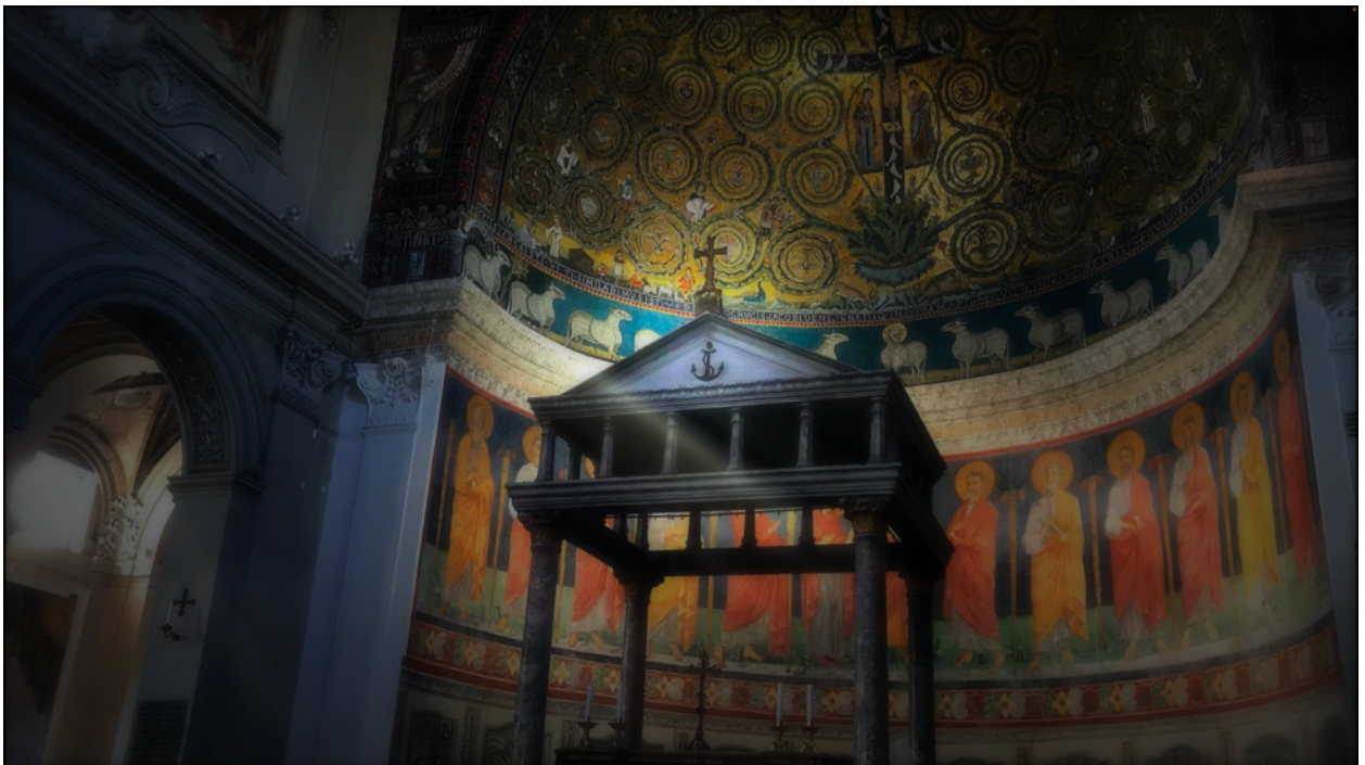
Church of St. Clement of Rome