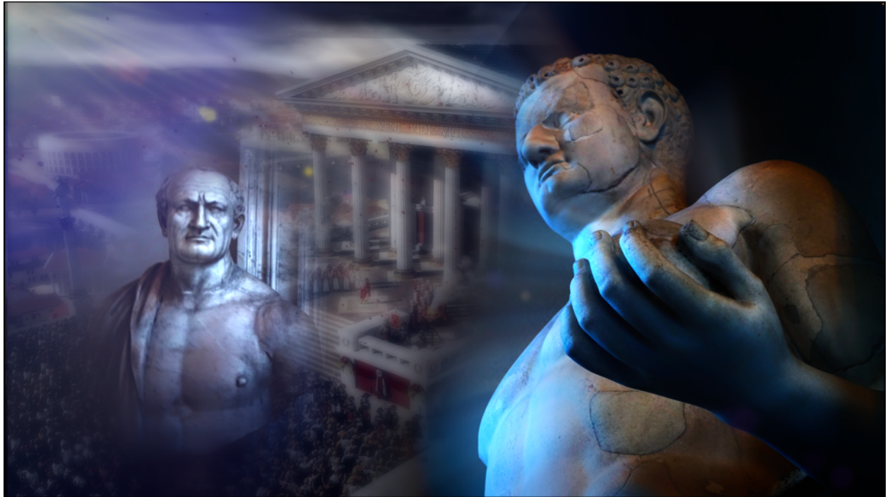
Flavius Vespasian and his son, Titus Flavius, Emperors of Rome